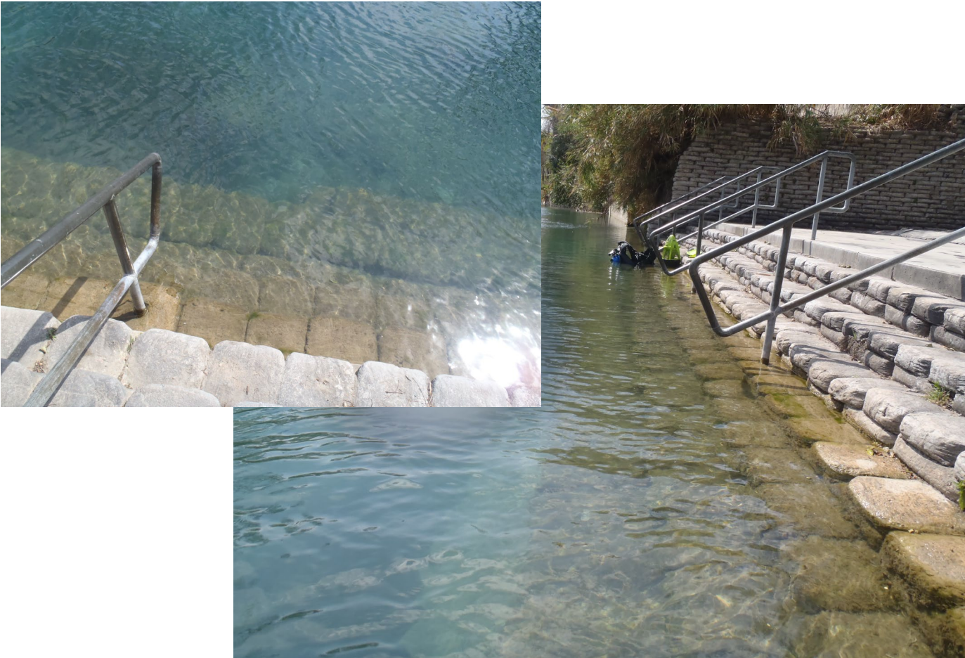
Existing Stairs and Landing