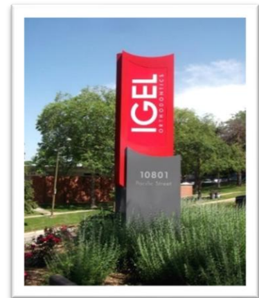
Monument Sign Examples