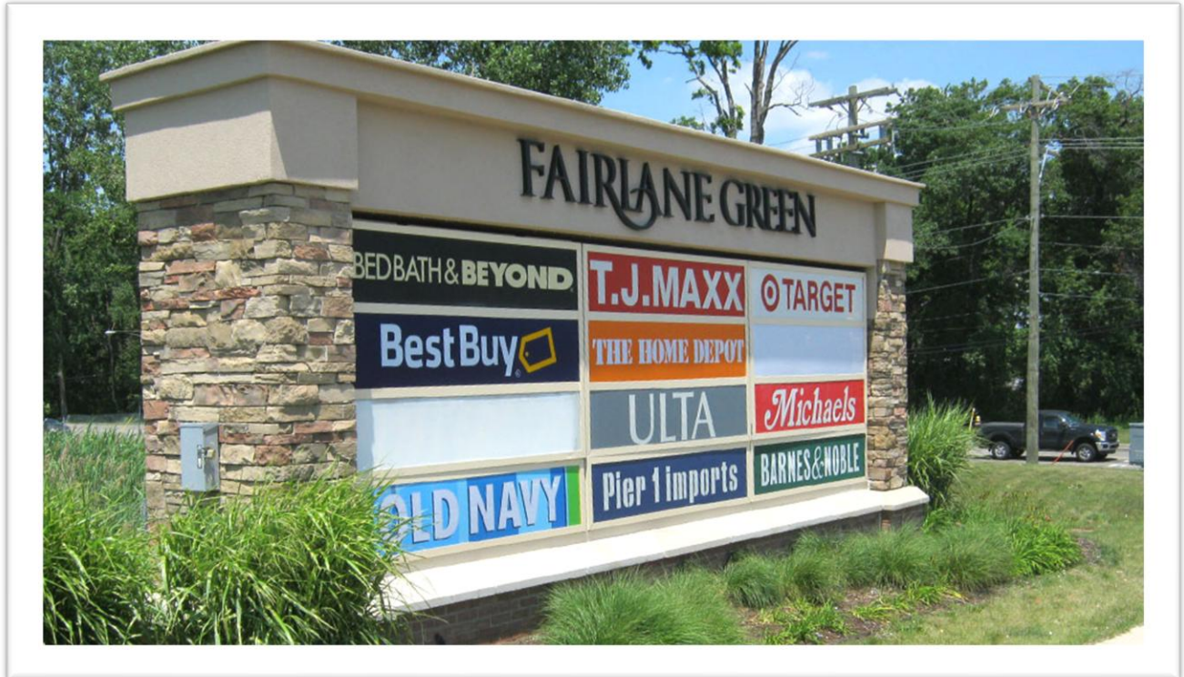
Multi-Tenant Sign Example