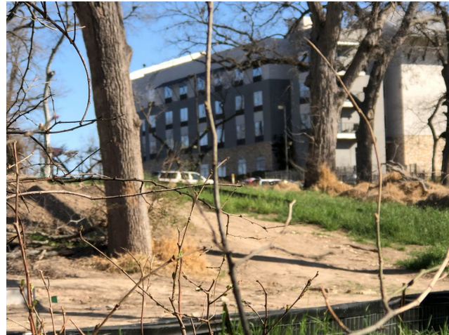
5b - View from eastern border of subject property across new commercial development and to Marriott Hotel