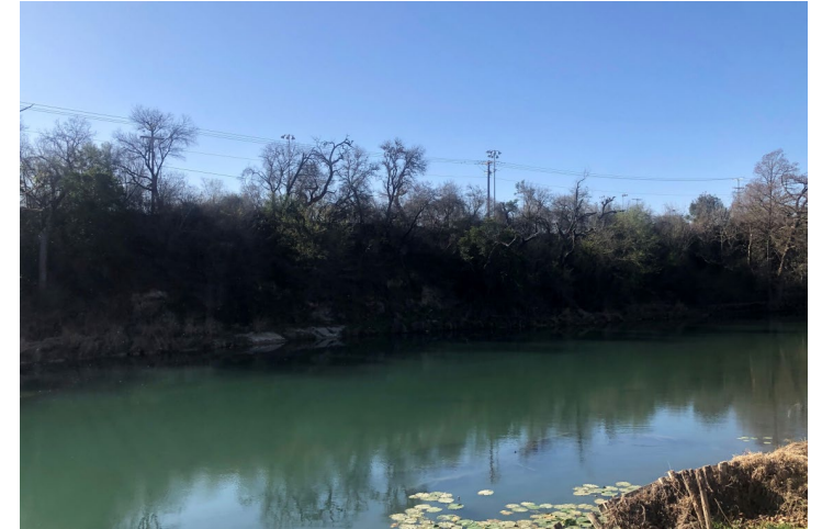
5c - View from subject property across Guadalupe River to Sports fields at Camp Comal