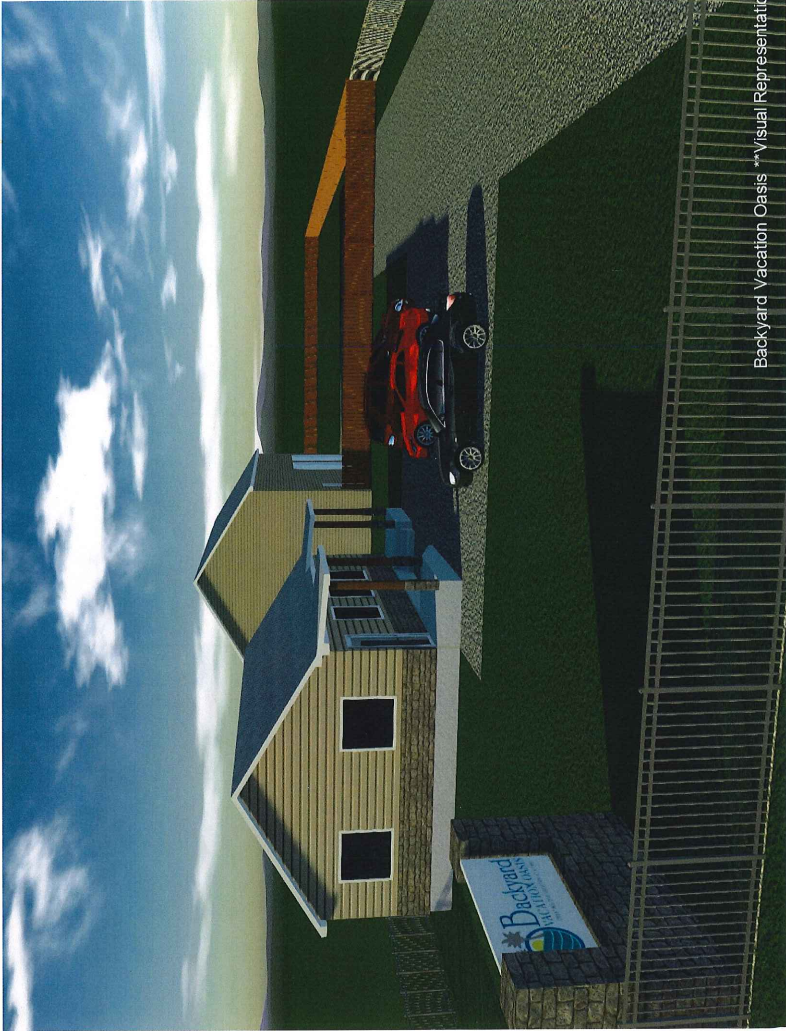
Backyard Vacation Oasis **Visual Representation