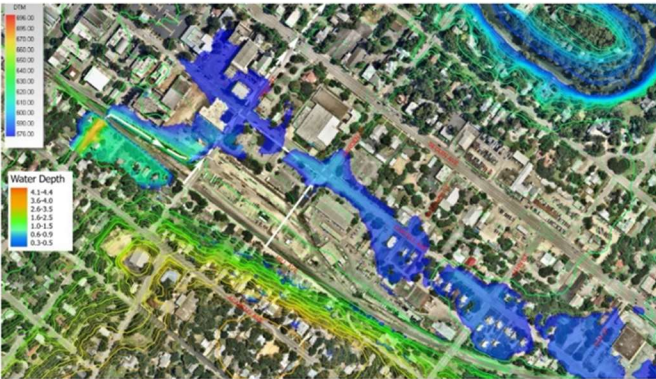
Existing 100-year storm flooding