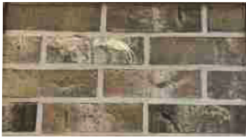
Pylon Base Detail Adobe Wells brick color