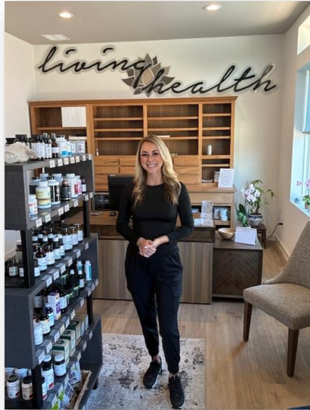
Living Health Holistic