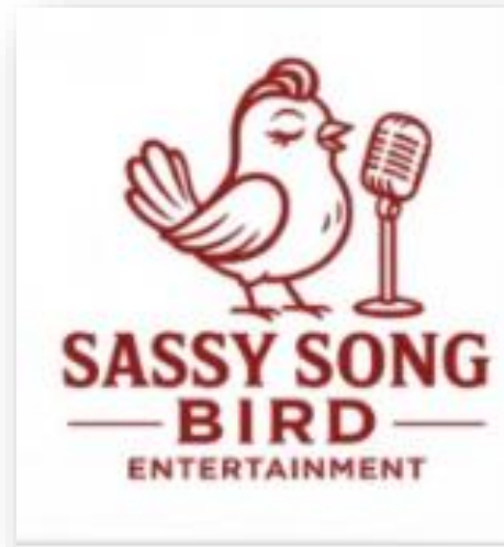
Sassy Song Bird Entertainment