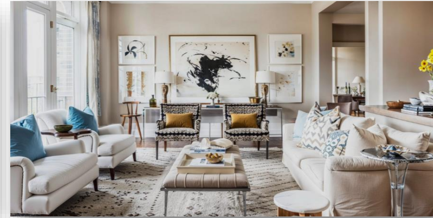
This is Home Interior Design