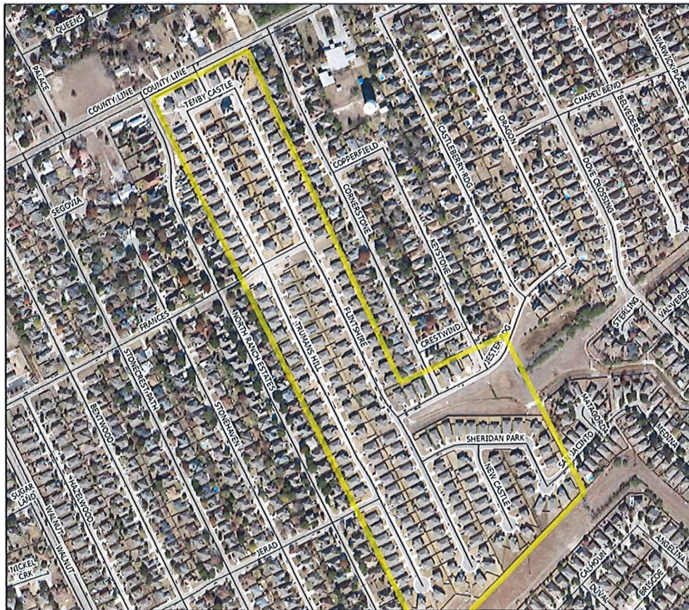
Figure 1. Park Ridge Estates Subdivision

The statutory maximum speed limit in the City of New Braunfels is 30 miles per hour (mph) except where otherwise established by ordinance and posted by official traffic signs. Park Ridge Estates is a subdivision located off the south side of W County Line Road between S Walnut Avenue and FM 725. The posted speed limit throughout the subdivision is 30 mph, and all streets have sidewalks on both sides. Park Ridge Estates has direct connection to W County Line Road where the posted speed limit is 35 mph.