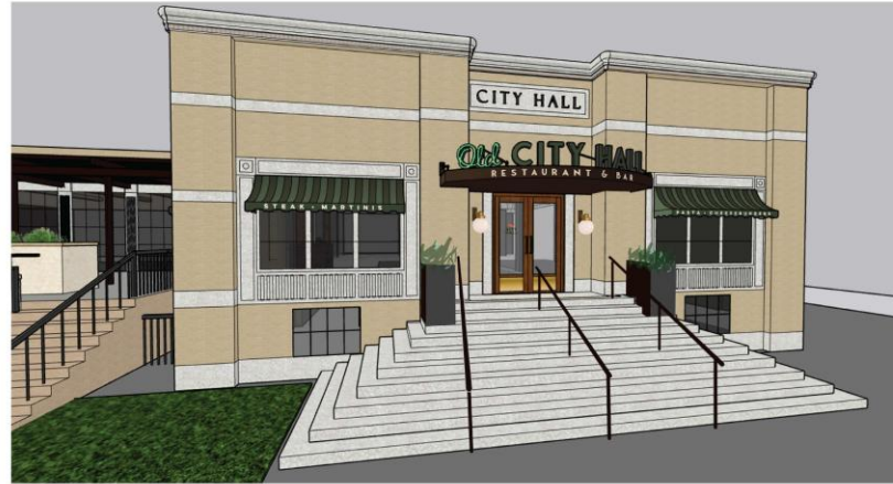
A Front-Lit, Plex-Face Channel Letters w/ LED, Individually Mounted ¥Front View