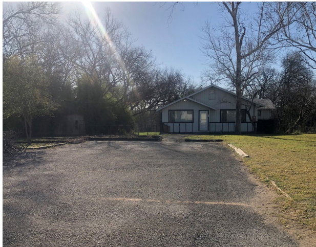
5d - View of subject at drive way entrance from Granada