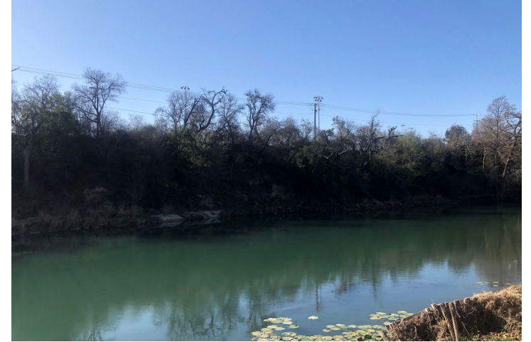
5c - View from subject property across Guadalupe River to Sports fields at Camp Comal