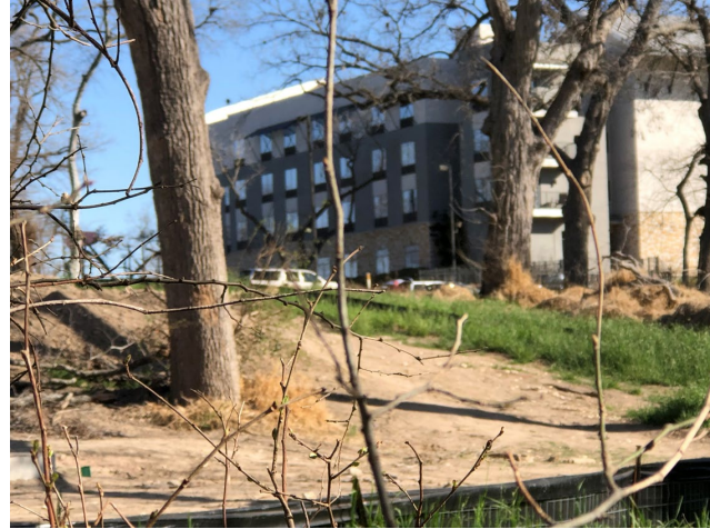
5b - View from eastern border of subject property across new commercial development and to Marriott Hotel