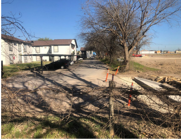
5a - North East corner of subject property, adjacent commercial development, and apartments complex across Granada. Note IH 35 in the background.