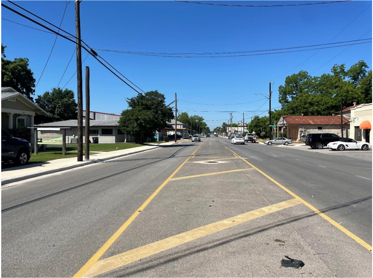
Image 6: Three-lane street section with center turn lane from Clemens Avenue to S. Guenther Avenue (89' tapering to 70')