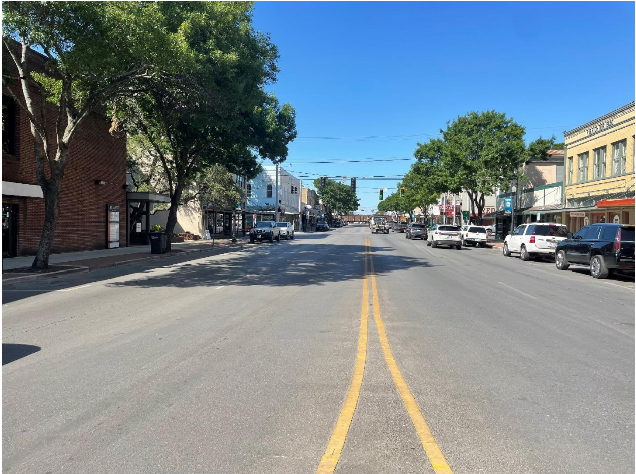
Image 1: Four-lane street section west of Main Plaza (95' right-of-way)