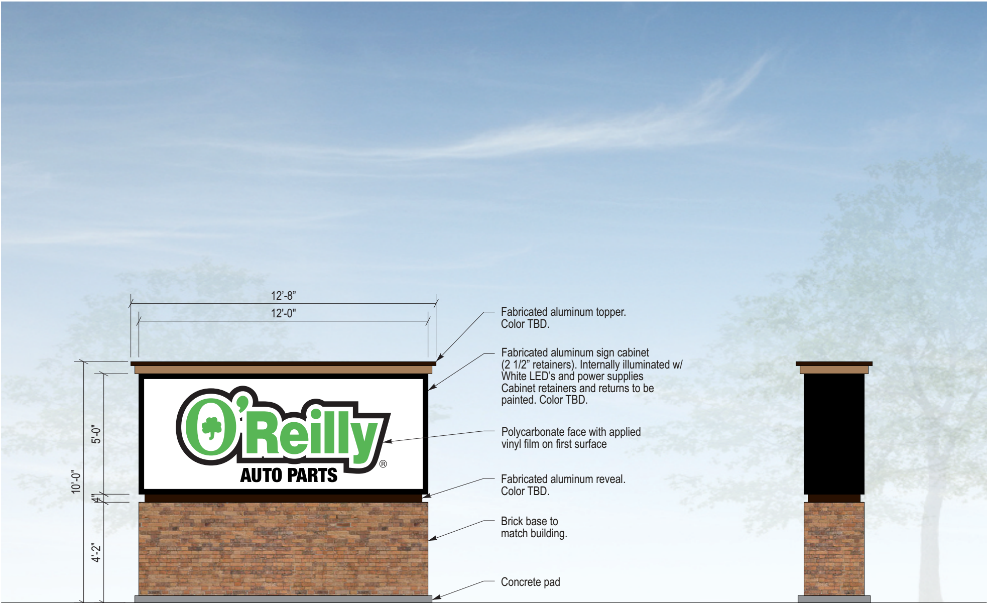
Sign Layout Detail Scale: 1/4" = 1'-0"