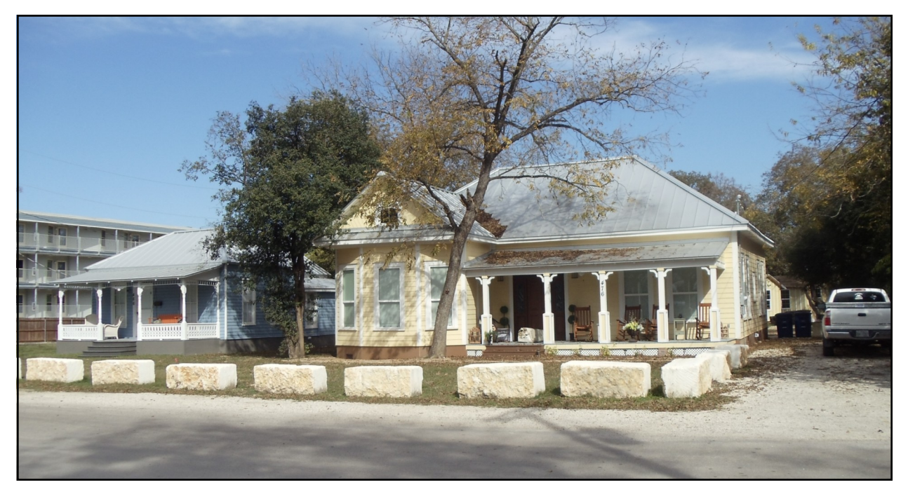
Facing north toward the property from N. Market St.