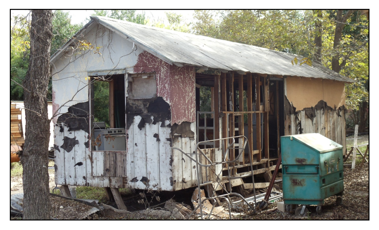
Sample condition of original cabin.