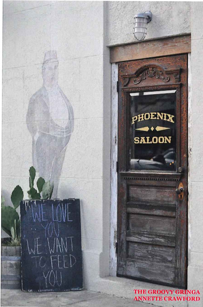
THE GROOVY GRINGA ANNETTE CRAWFORD