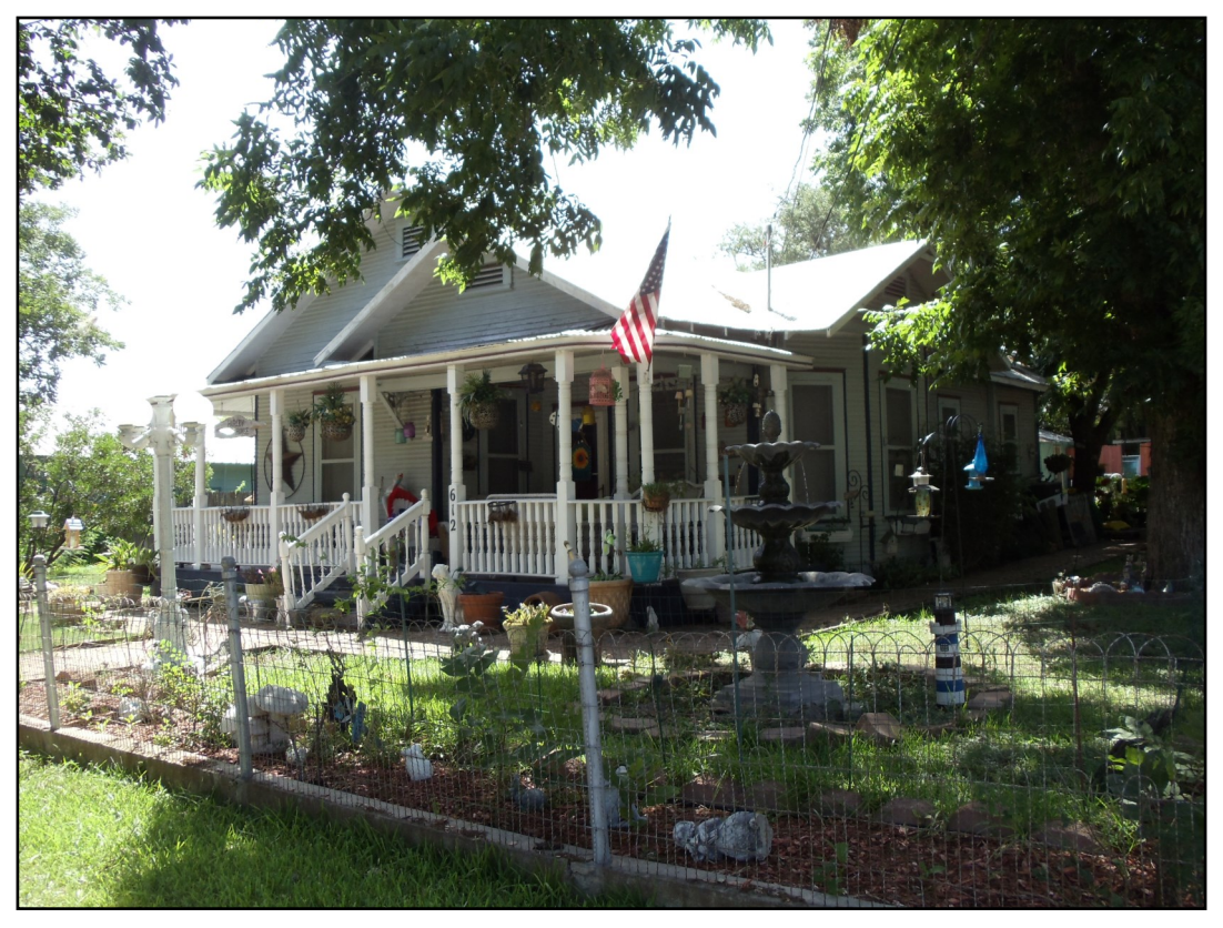
Subject Property from E. Common St.