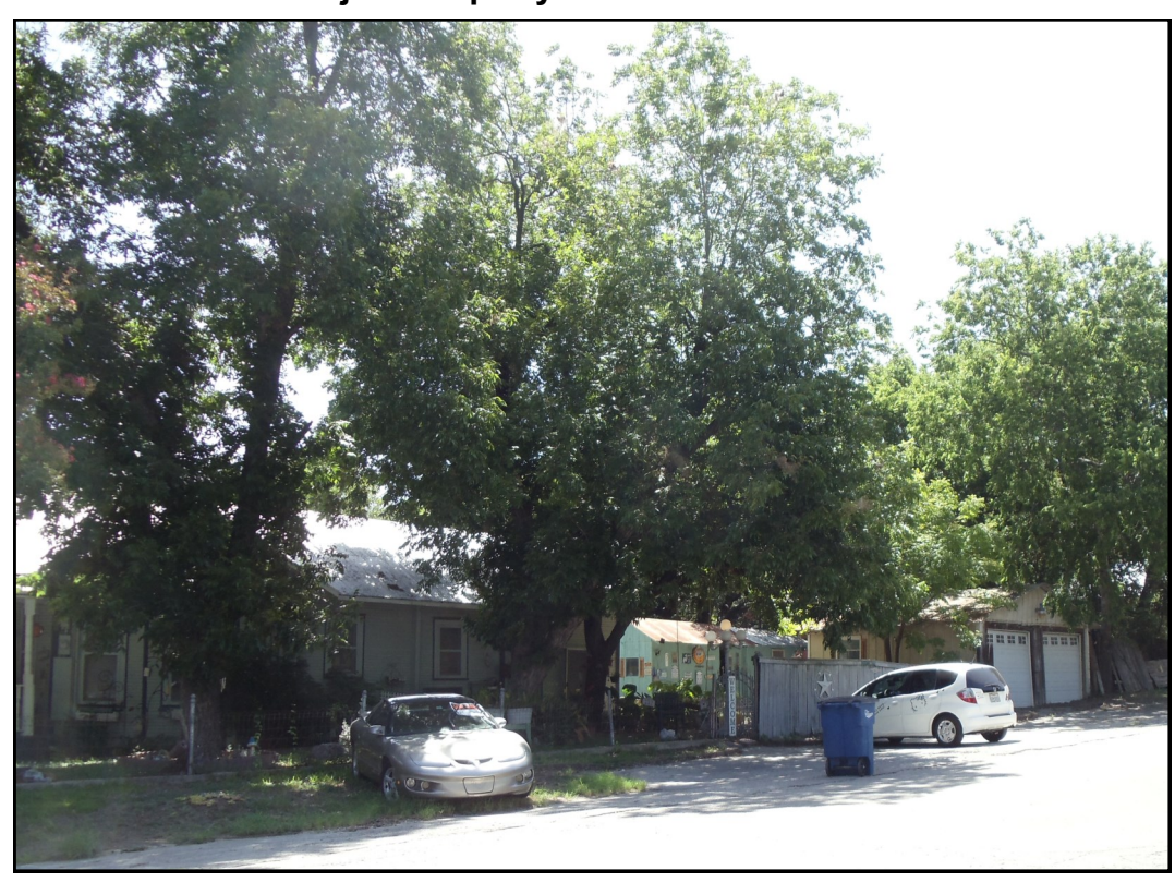
Subject Property from S. Grant Ave.