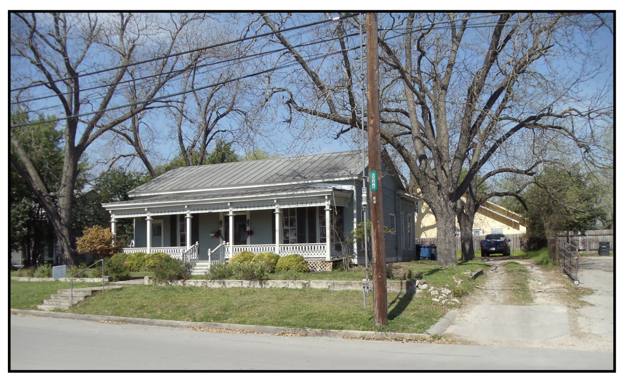
Subject Property from W. Mill St. facing northwest