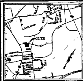
LOCATION MAP NO SCALE

DETAIL PLAN ESTABLISHING COTTON COTTAGES