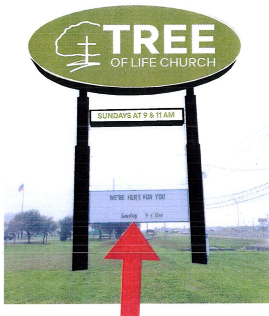
Existing 6'x20' marquee sign that has been removed

Remove existing 6'x20' manual changeable copy sign cabinet & install 5' x20' LED message center on existing sign structure as per rendering.