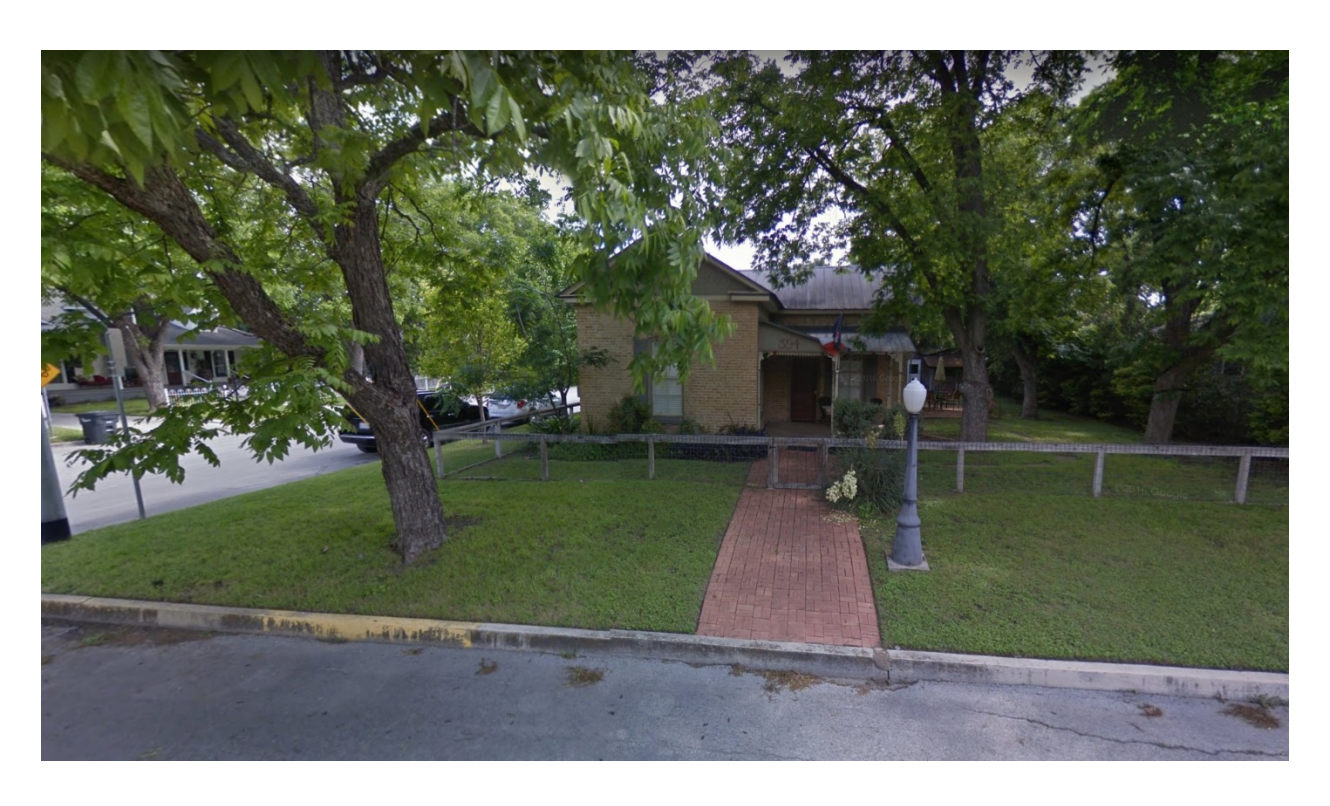
Subject Property from Market Avenue