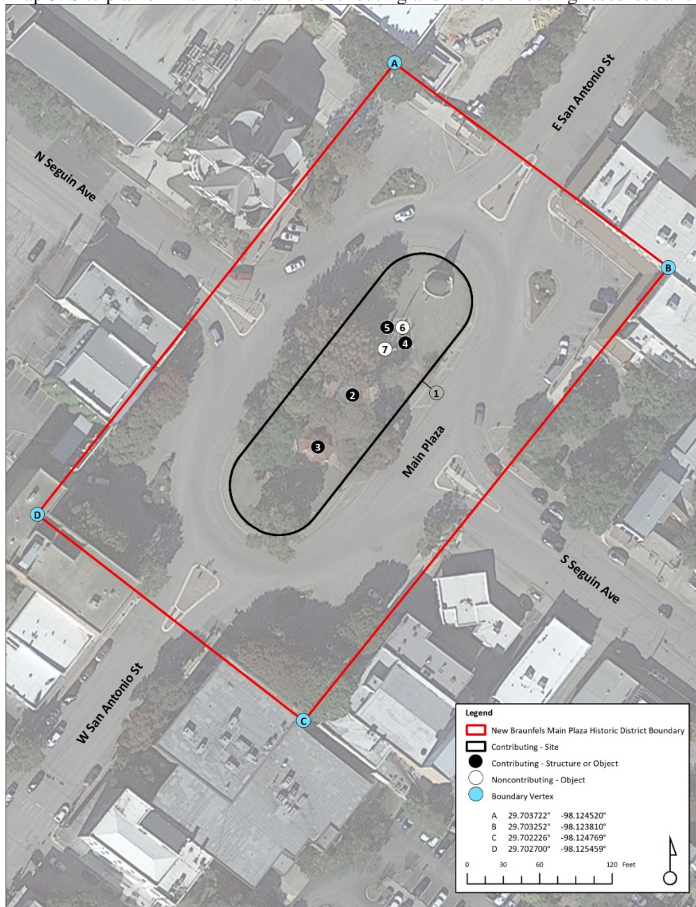
Map 3. Site plan of Main Plaza with contributing and noncontributing resources and boundary vertices.